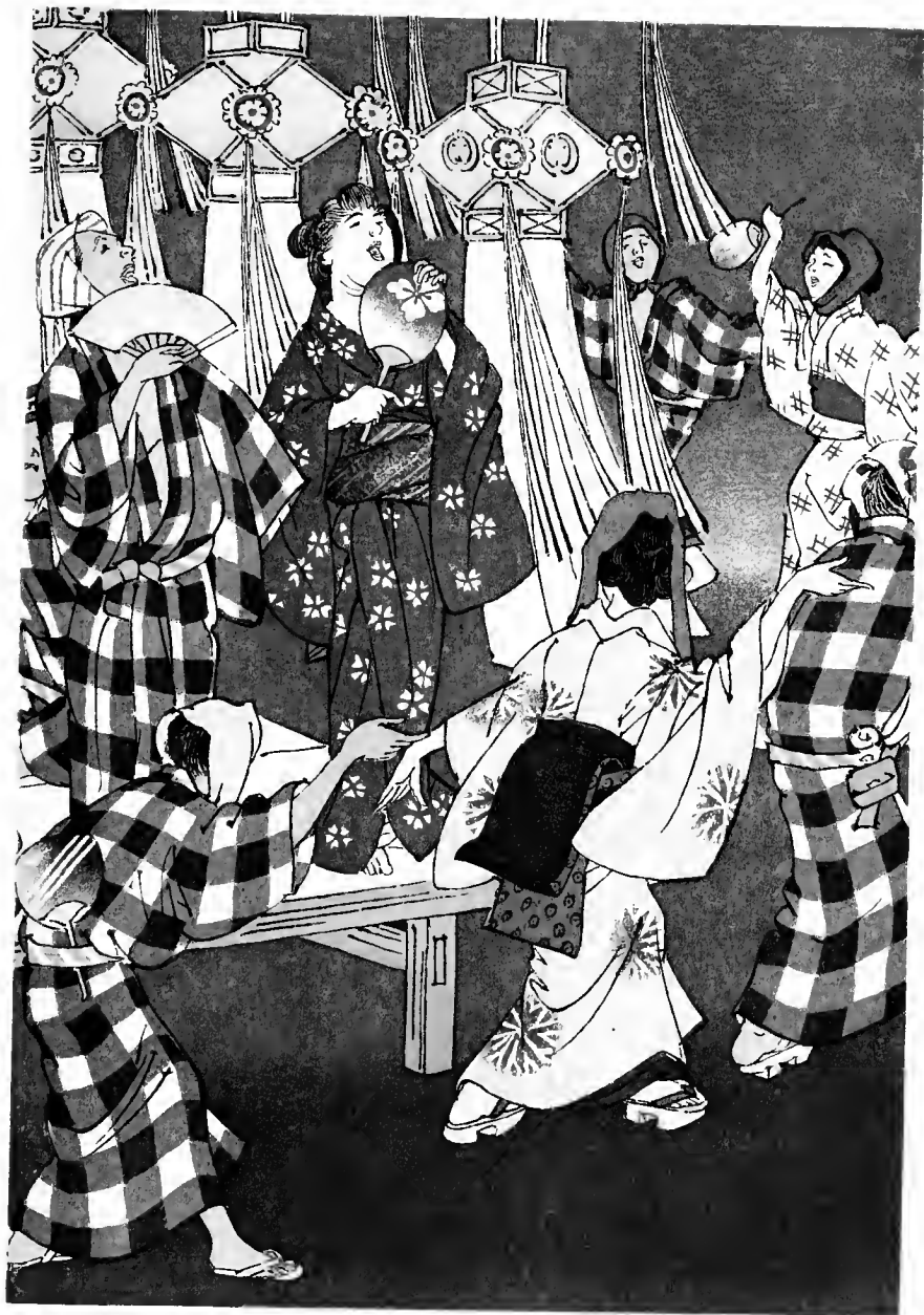
Dancers at Feast of Lanterns.